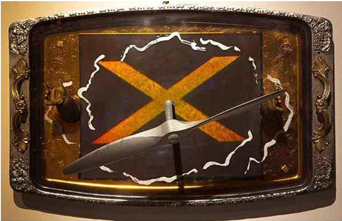
'Catch Me' by Al Razutis 1985 Silver Halide Reflection hologram in mixed-media sculpture -18" x 13" x 7" with projecting image

BY AL RAZUTIS, 1985 -- WHITE-LIGHT REFLECTION HOLOGRAM ASSEMBLY