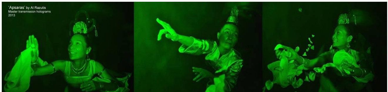
Holograms pictured here illuminated by 100 mw green diode laser

Six of these 'Apsaras' were placed on exhibition at Lanzhou City University Dun-Huang Creative Center in October 2014. They were viewed by government officials, the media, academics and engineers who came to the exhibit and demonstration. They were received enthusiastically and featured on TV in China.